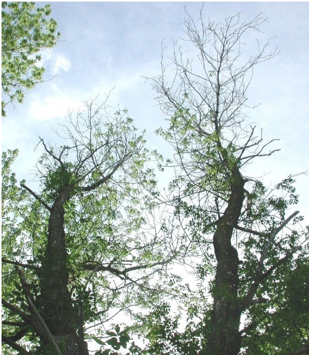
EAB-infested ash trees often die in 3-5 years.