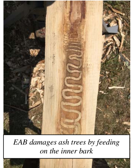
EAB damages ash trees by feeding on the inner bark

Yes, EAB has been recently discovered in Frenchville, Grand Isle, Madawaska, Acton, and Lebanon, Maine, and is expected to establish in other parts of Maine. With over 100 million native ash trees located throughout Maine, EAB will have significant economic and ecological impacts.